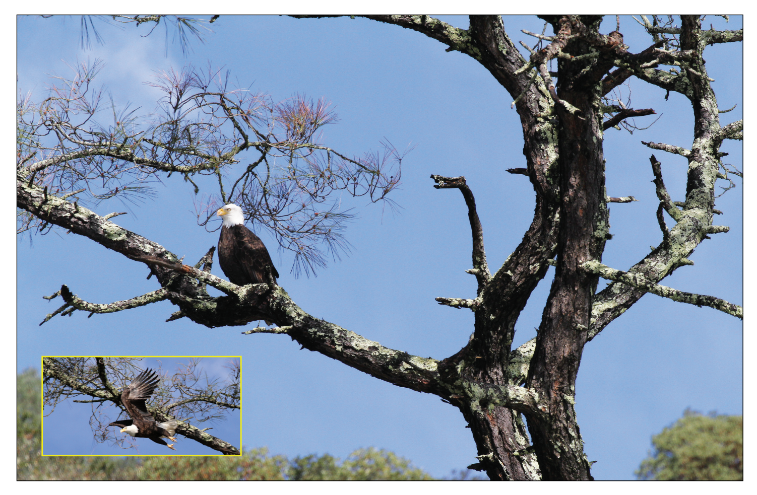
An eagle is spotted perched atop a tree branch along the Lake Sonoma shoreline Jan. 10. Corps officials from the San Francisco District and South Pacific Division conducted their annual midwinter bald eagle survey at the Corps-managed property. A similar survey was done at Lake Mendocino.