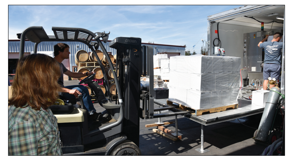
Schaaf loads wine cases into a delivery truck, while Marks, right, shows off a bottle of Deux Punx. Winter 2019