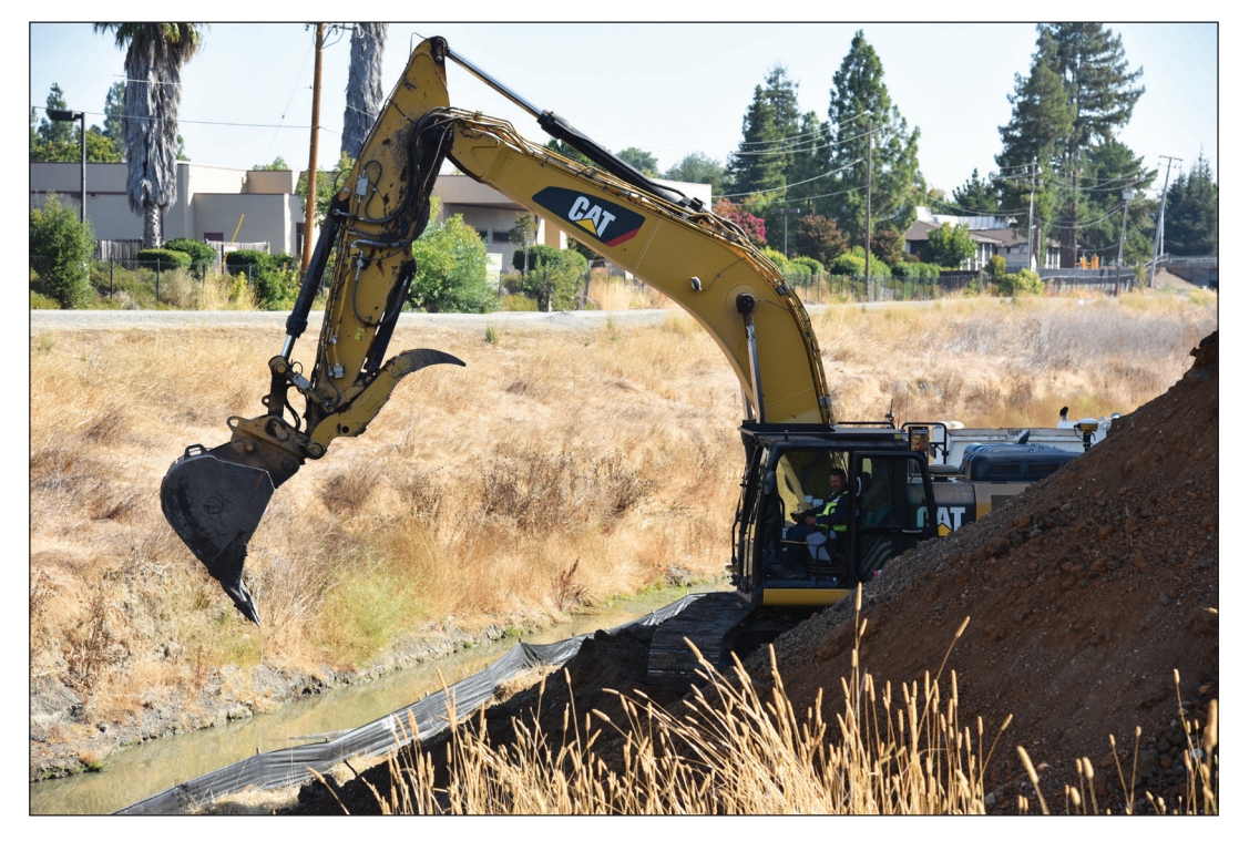
Repairs are underway by the Corps' San Francisco District to a levee damaged by winter storms in Pleasanton.

The levee repairs fall under a rehabilitation program that provides for the inspection and rehabilitation of both federal and non-federal flood risk management projects damaged or